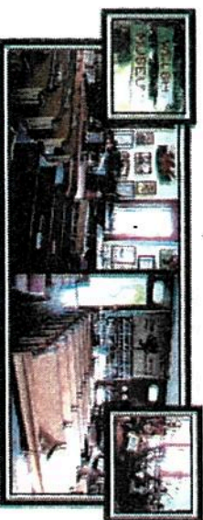
L. Welsh-American Heritage Museum